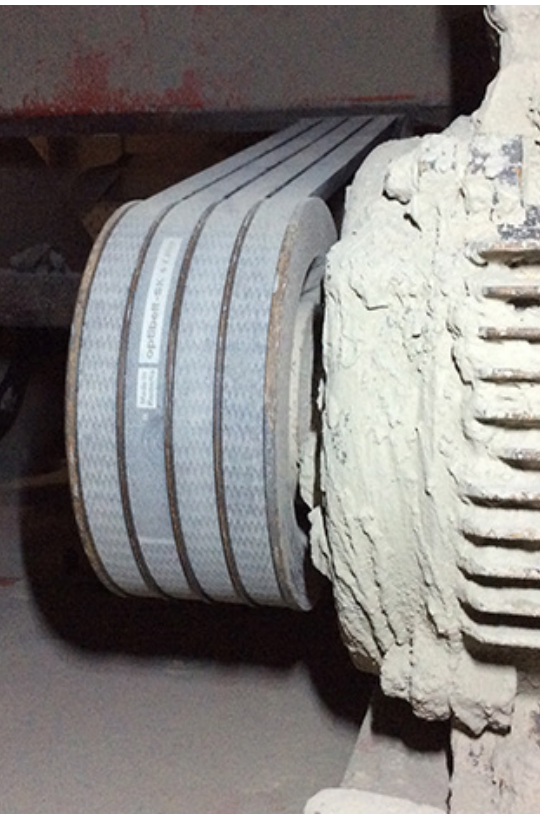
Close-up of original setup

Although the customer had installed dust guards to try to prevent dust ingress, this was insufficient to keep the belts dust-free.