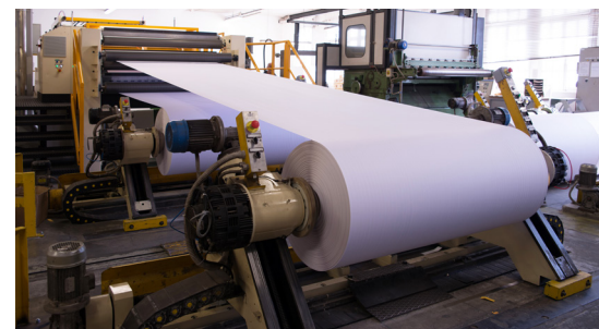
Pulp and paper production