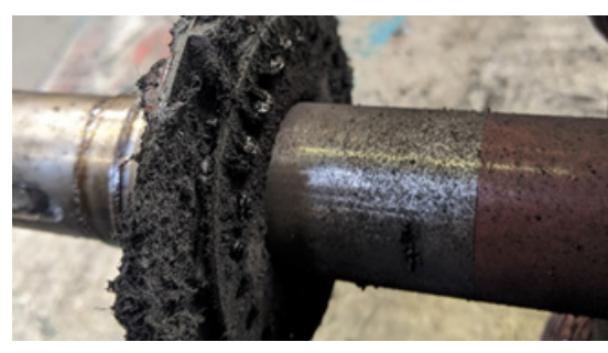
Deteriorated and contaminated Drive End