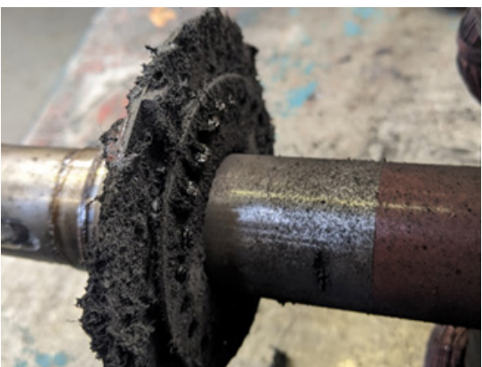
Deteriorated and contaminated Drive End