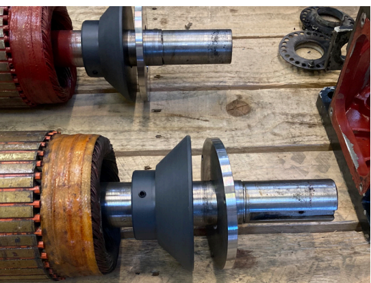
New Drive End following re-engineering work

Based on the findings from the initial trend data, a decision was made to remove the machine for inspection and further diagnostics, allowing ERIKS engineers to investigate the root cause in greater detail.